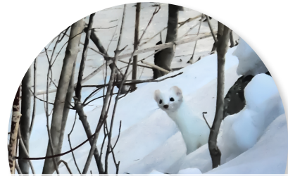
Ermine seen on the land in January

T oday we have an opportunity to further improve the Jacob Messer Farm conservation property by purchasing 9.4 additional acres on Morgan Hill Road. With spectacular views, this parcel was only recently subdivided for sale and development. Its location provides direct access to 123 acres of Messer woods, facilitating both recreation and forestry — and bypassing the 21 acres of working agricultural fields on Little Sunapee Road which are now leased to Spring Ledge Farm. Once more, we ask for your support in this small but significant acquisition.