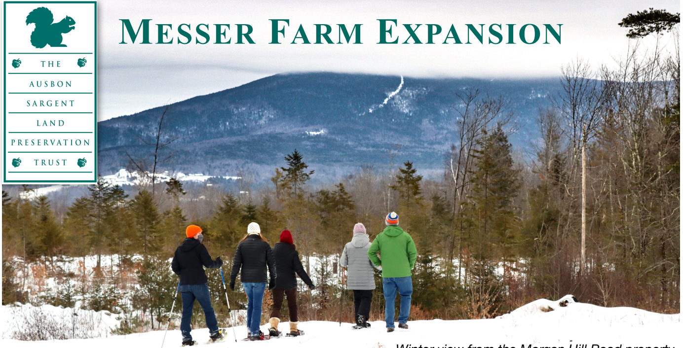
Winter view from the Morgan Hill Road property

T oday we have an opportunity to further improve the Jacob Messer Farm conservation property by purchasing 9.4 additional acres on Morgan Hill Road. With spectacular views, this parcel was only recently subdivided for sale and development. Its location provides direct access to 123 acres of Messer woods, facilitating both recreation and forestry — and bypassing the 21 acres of working agricultural fields on Little Sunapee Road which are now leased to Spring Ledge Farm. Once more, we ask for your support in this small but significant acquisition.