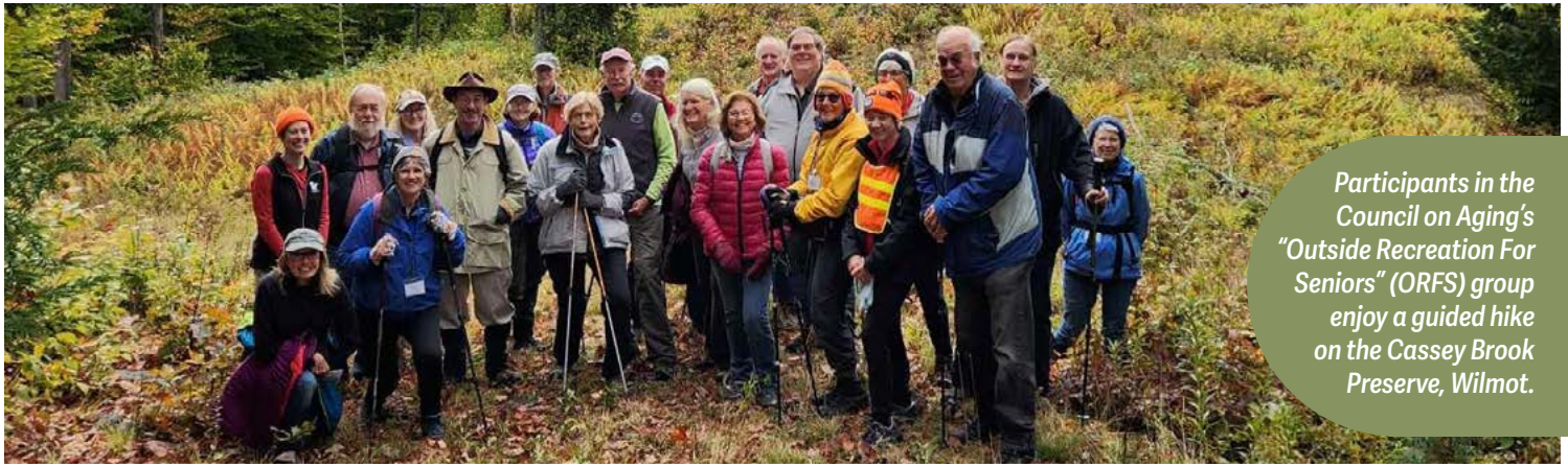
Participants in the Council on Aging's "Outside Recreation For Seniors" (ORFS) group enjoy a guided hike on the Cassey Brook Preserve, Wilmot.