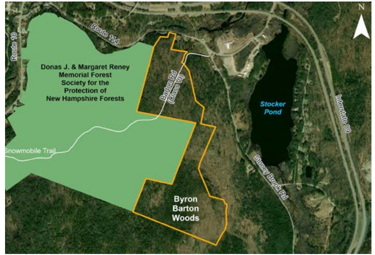
A map showing the proximity of the Byron Barton Woods property in Grantham.