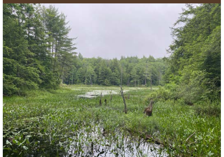
Some of the busy wetland habitat within the McLaughlin property.