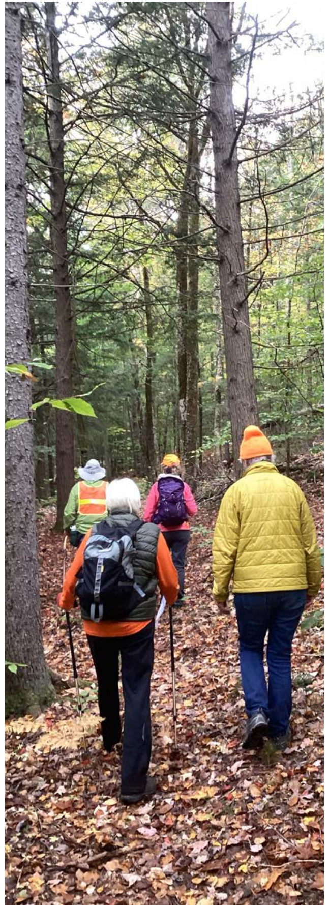
Volunteer monitors and landowners on an annual monitor visit.