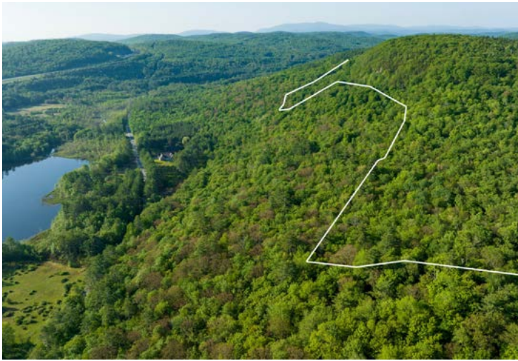
An aerial view showing the outline of the Byron Barton Woods property.