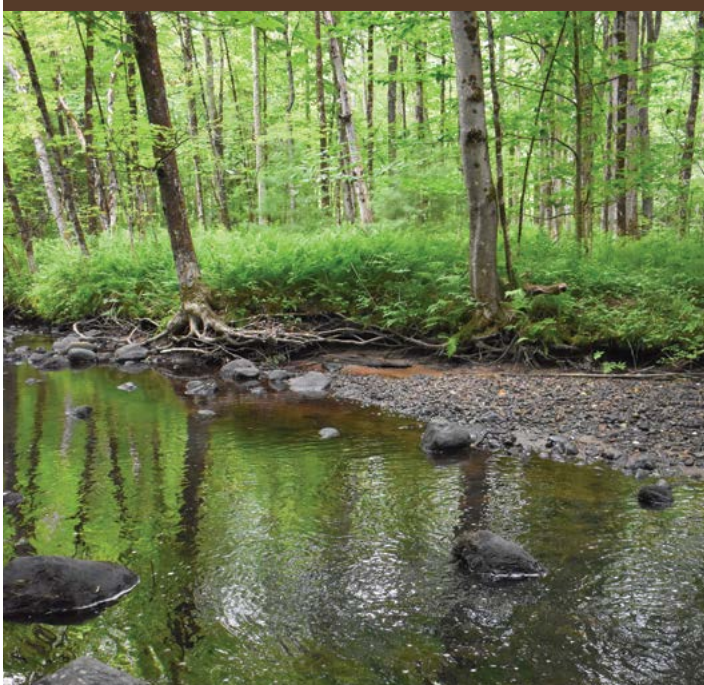
A view of Sucker Brook along the McDonough property.