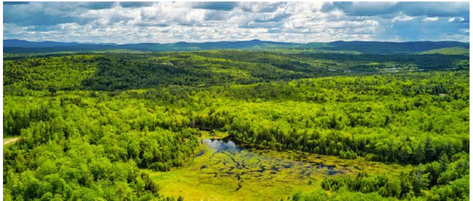
An aerial view of the Sawyer Brook Headwaters property in Grantham.

*denotes gifts to both Membership and Annual Fund