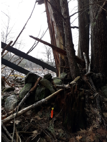
Helpful Monitor Photos