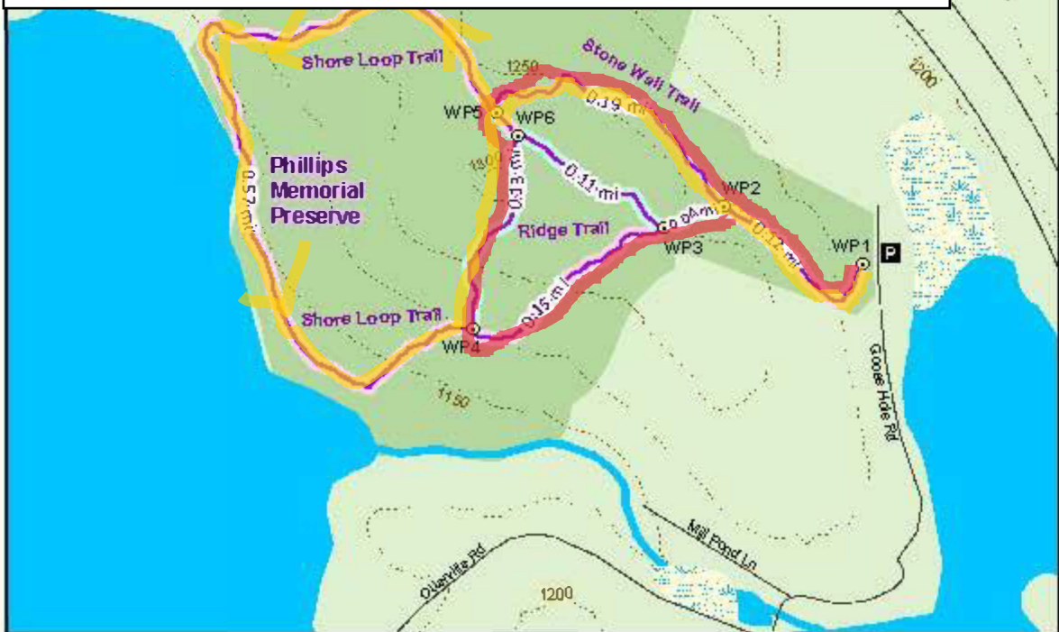
Note: Numbers indicate Waypoint Locations.