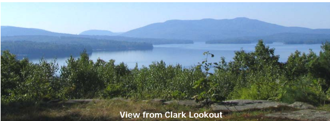
View from Clark Lookout